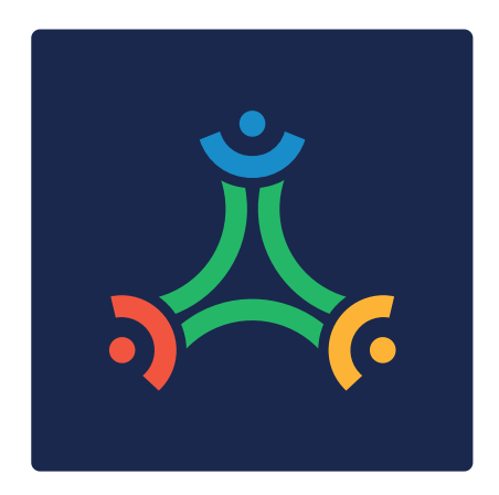
On darker colored backgrounds, please use our colored icon most of the time.