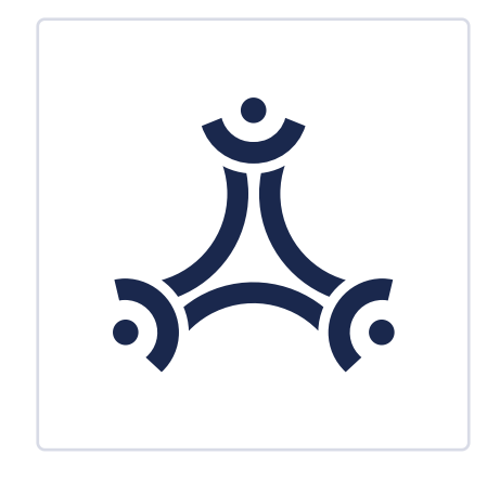
Printing one color? Use our Regal Blue icon.